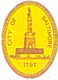
Catherine E. Pugh Mayor